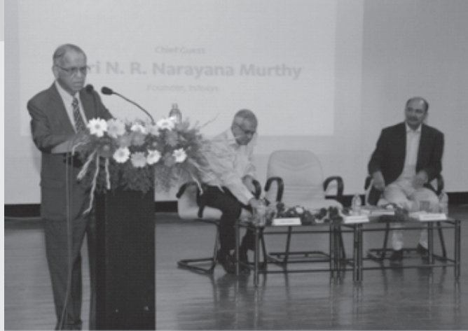
Shri N. R. Narayana Murthy, Founder, Infosys, delivered 78th Kale Memorial Lecture

Shri N. R. Narayana Murthy, Founder, Infosys, delivered the Seventy-Eighth Kale Memorial Lecture 2017 on “Role of Culture in Economic Growth and in Elimination of Poverty in India” on March 18, 2017.